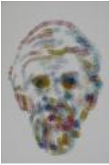
Bearded Man with Random Circles (C06.00270)