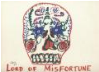
Lord of Misfortune (C0713049)