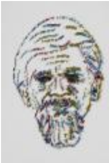
Bearded Man with Random Stars (C06.00271 )