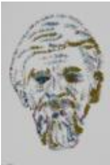
Bearded Man with Random Triangles (C06.00272 )