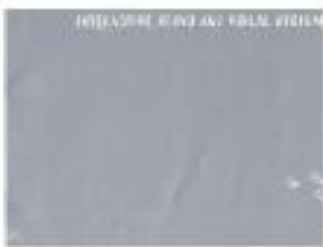
Interactive Sound and Visual Systems (C07.14005)