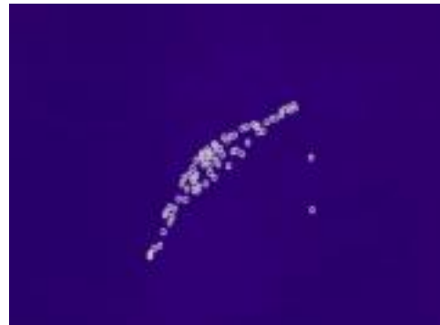
Random Circles (C07.13144)