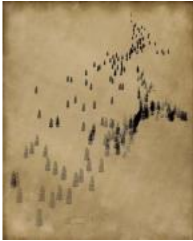
Random Pines (C06.00348)