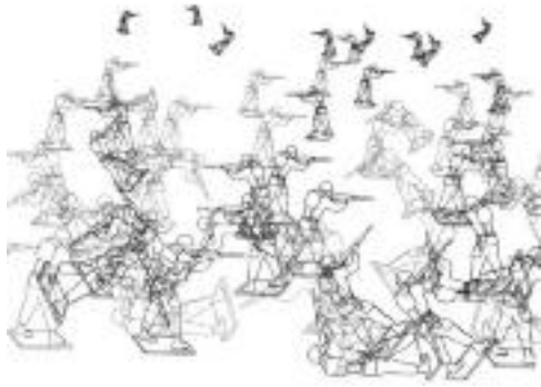
Random War, fragment (C07.13155)