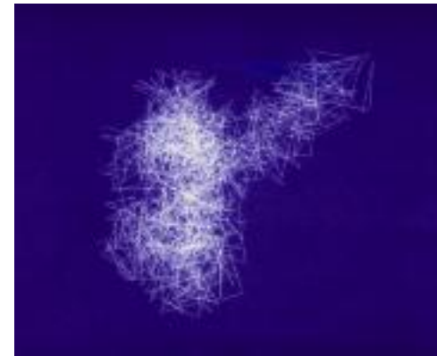
Random Triangles II (C07.13146)