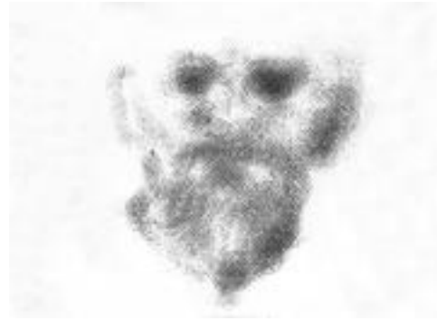
Random Light and Shadow (C07.13114)