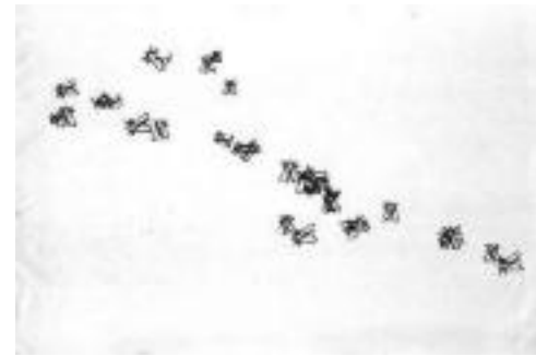
Random Flies (C07.13157)