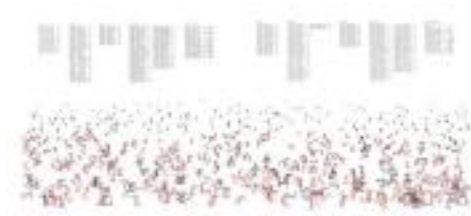
Random War (C07.13132)