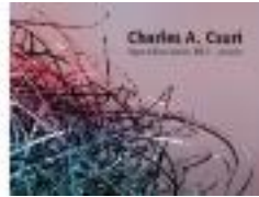
Charles A. Csuri: Beyond Boundaries, 1963 - present (C07.14004)