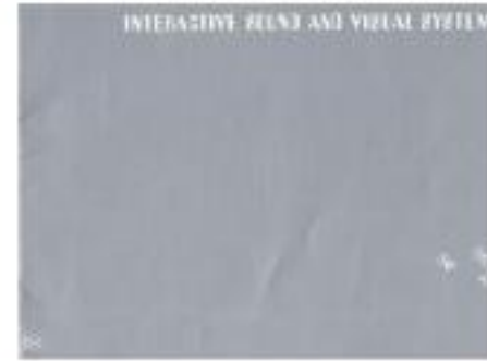
Interactive Sound and Visual Systems (C07.14005)