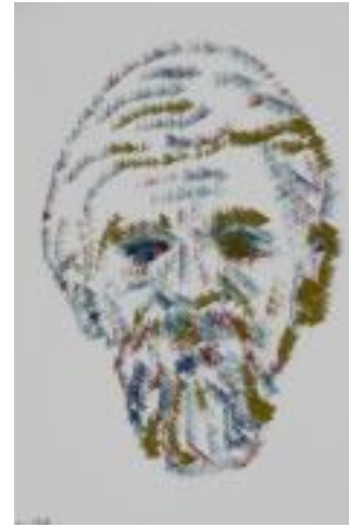
Bearded Man with Random Triangles (C06.00272 )