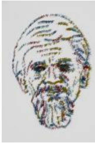
Bearded Man with Random Stars (C06.00271 )