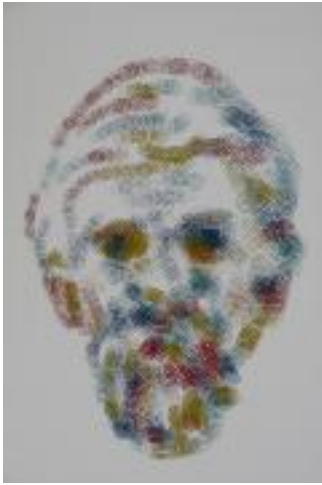
Bearded Man with Random Circles (C06.00270)