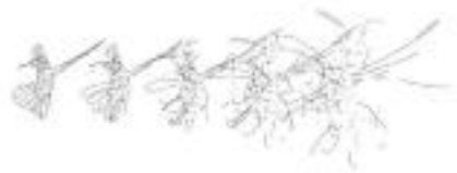
Hummingbird II (C07.13123)