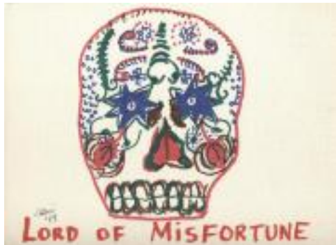
Lord of Misfortune (C0713049)